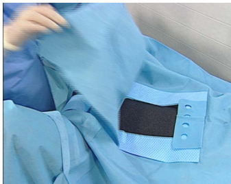
5. Perineal flap helps to isolate the perineal area.