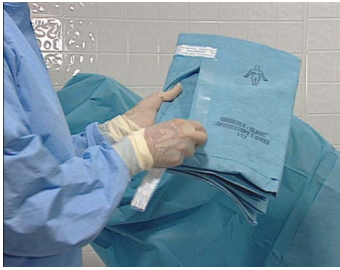
1. With Leggings and an Under Buttocks Drape in place, orient body stamp on drape with patient. Remove adhesive strip liners clockwise.