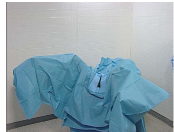
6. Insert surgical lines and tubing through the tube holders to complete draping.