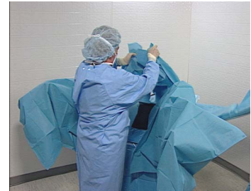
3. Unfold drape, first laterally and then, following arrows, bring drape down between legs to expose perineal fenestration. Firmly seal abdominal fenestration to patient's skin.