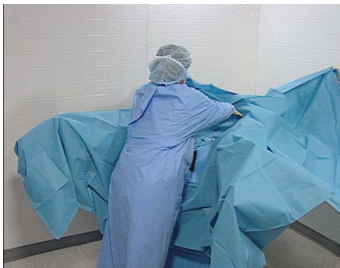
4. Unfold upper portion toward head to form an anesthesia screen.