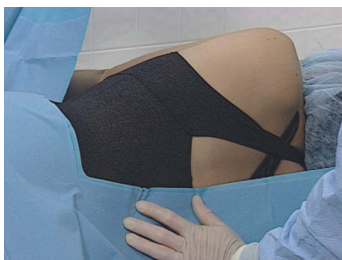
4. Position tails of U-Drape lateral to the operative site.