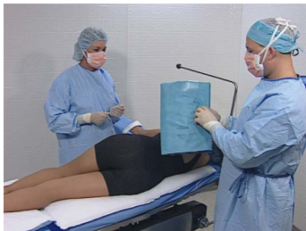
1. Orient body stamp on Chest U-Drape with patient and remove adhesive strip liner.