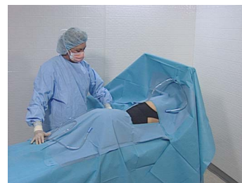
6. Unfold laterally, then toward head to form an anesthesia screen, and extend armboard covers laterally. Insert surgical lines and tubing through the tube holders to complete draping.