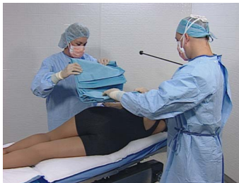
2. Center base of U-Drape at bottom of operative site.