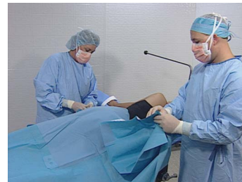
3. Unfold drape, first laterally, then toward patient's feet, exposing tails of the U-Drape. Remove the adhesive strip liners from the U-Drape.