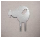
770993 (Silver) (was 770008 white)

09021 Two Roll, Standard Roll Tissue Dispenser, Smoke/Grey 09142 PERFORMA Dual Roll Vertical, White 09152 Decorator Recessable Lever, Pearl/White 09561 PERFORMA JRT JUNIOR, Tan Enamel 09564 REFLECTIONS JRT JUNIOR, with logo 09571 PERFORMA JRT, Tan Enamel 09600 PERFORMA CONTIN-U-MATIC Tissue 09682 Dual Roll Tissue 09703 Touchless, Electronic Roll Towel Dispenser, Smoke 09704 Touchless, Electronic Roll Towel Dispenser, White 09711 CONVERT-A-MATIC HRT, Light Grey 09712 CONVERT-A-MATIC HRT, Grey 09713 CONVERT-A-MATIC HRT, Tan 09714 REFLECTIONS CONVERT-A-MATIC 09715 IN-SIGHT* CONVERT-A-MATIC 09717 WINDOWS* CONVERT-A-MATIC, Pearl White 09780 CONVERT-A-MATIC, Recessed, Touchless, HRT Dispenser 09781 CONVERT-A-MATIC, Recessed, Touchless, HRT Dispenser 09839 PERFORMA S-fold, White Enamel 09960 Combination Soap/Towel, Stainless Steel